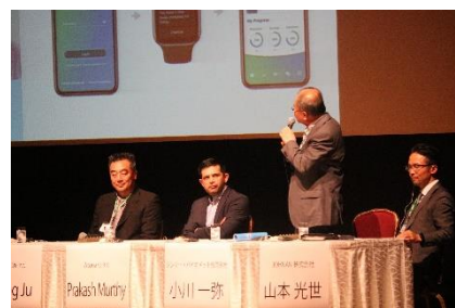
A-3 Successful Cases of US-Japan Collaborations