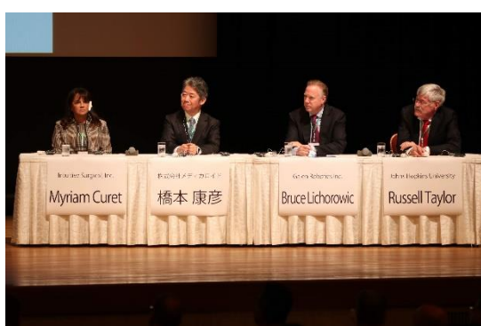
(Panel Discussion) Panelists