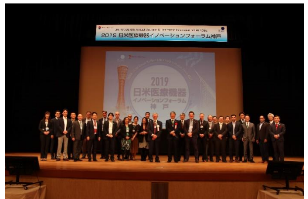
USJMF/Moderators · Panelists