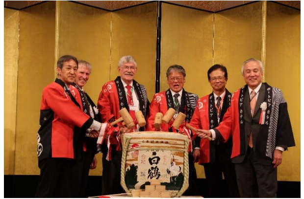
Sake Barrel Ceremony