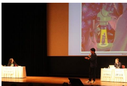
A-2 Medtech and Healthtech for Super Aging Society