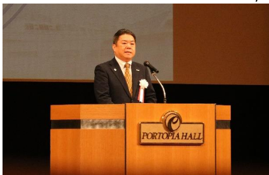
(Opening Remarks) Hidetoshi Terasaki, Vice Mayor of Kobe City