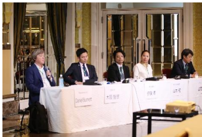
B-2 How to Foster Players for Medical Device Development