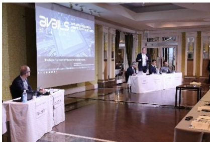
B-1 Developing Unmet Needs Driven Innovative Medical Devices