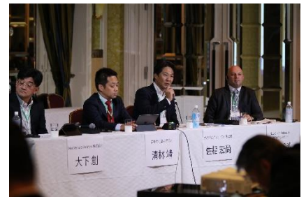
B-3 Understanding Evaluation Criteria for Investors