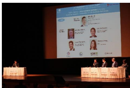
A-1 Innovation in US Medtech Hot Areas